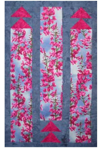
New kits at BPQ - "Bear's Paw Walking" in hot new plaids & stripes; "Fireweed" to take home as a memory of your trip.