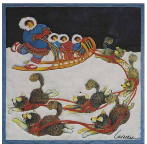
New printed panel from designer Barbara Lavalee.

Friday, September 2 - Saturday, September 3