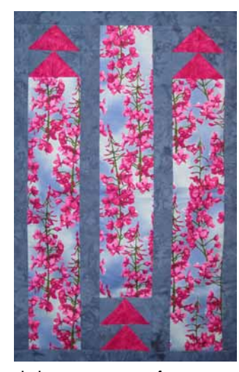
New kits at BPQ - "Bear's Paw Walking" in hot new plaids & stripes; "Fireweed" to take home as a memory of your trip.